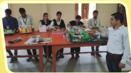
Art & Craft